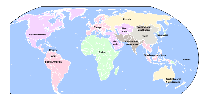
Figure 2: The 12 world regions used as geolocation targets.

as shown for commits in Figure 1. As a consequence the observed trends tend to be more stable in recent decades than in 40+ year-old ones, due to statistics taken on exponentially larger populations.